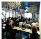
Power Day in Hanover, November 2014